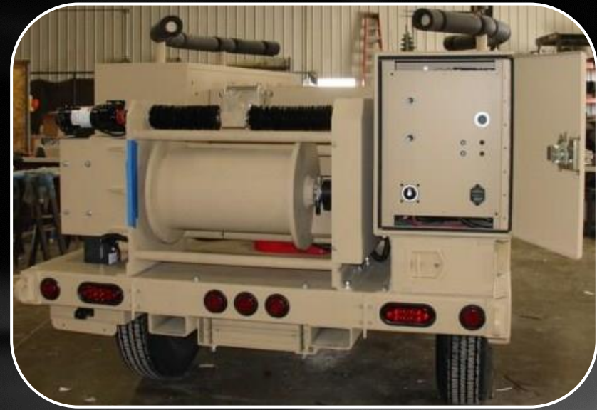
Winch, Tether and Control Panel